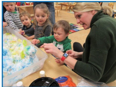
The Best Baby Playgroup is sponsored by:

August 8, 2018 September 12, 2018 October 10, 2018 November 14, 2018 December 12, 2018 January 9, 2019 February 13, 2019 March 13, 2019 April 10, 2019 May 8, 2019 June 12, 2019