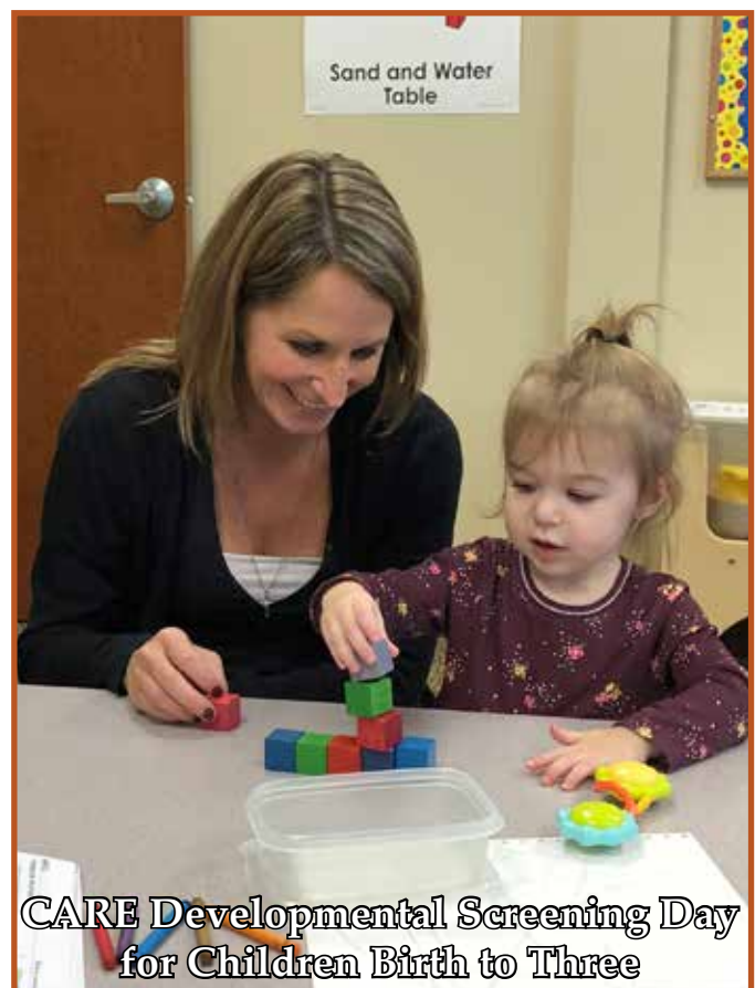
CARE Developmental Screening Day for Children Birth to Three