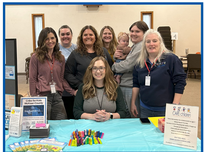
CARE staff members were on hand at the McKean County Community Fest at the Bradford YMCA in April. CARE had a safety display at the event, and staff also helped provide free developmental screenings.