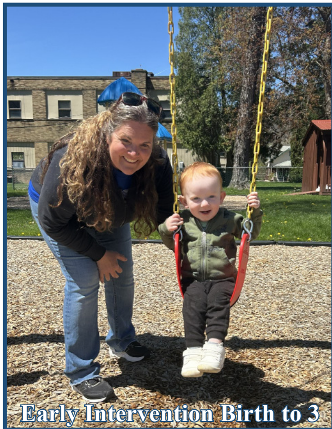
Early Intervention Birth to 3